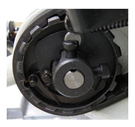
Safety Clutch: prevents damage from thread lock.