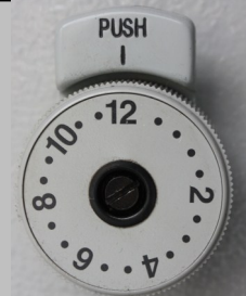
Stitch length up to 12mm CX