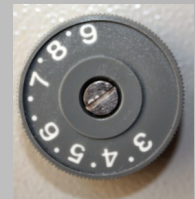
Stitch length up to 8 mm