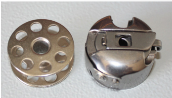
Large bobbin 11 X 25 mm