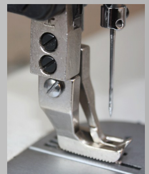
High lift to 13 mm With knee press Extra feet available, piping, half foot, etc.